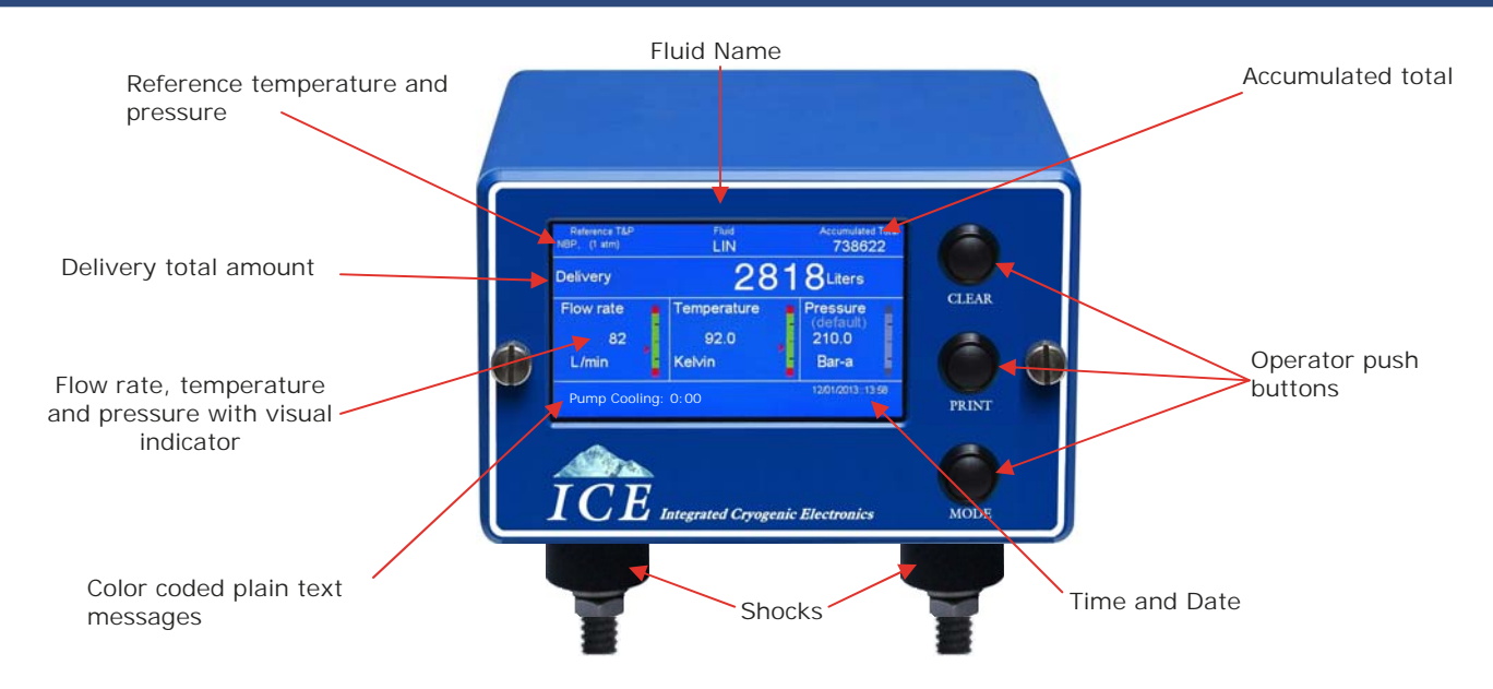
ICE Front Panel In Delivery Mode